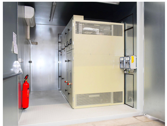
E-House equipped with MBS