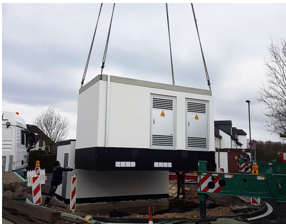
Moving a container